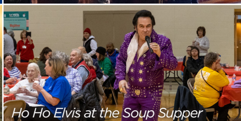
Ho Ho Elvis at the Soup Supper