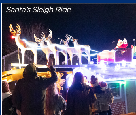
Santa's Sleigh Ride

The City of La Vista hosted more than 20 'Twas the Lights events in 2022 that brought people in our community together to celebrate the holidays. The City's celebrations began with Santa's annual sleigh ride through La Vista neighborhoods. This sleigh ride was particularly meaningful because it marked 30 consecutive years of the tradition in La Vista.