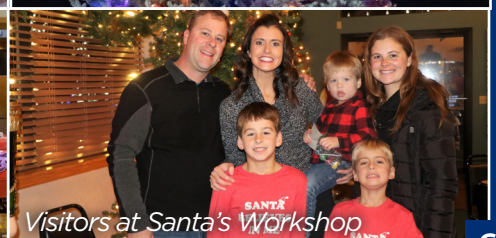
Visitors at Santa's Workshop