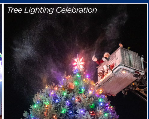
Tree Lighting Celebration