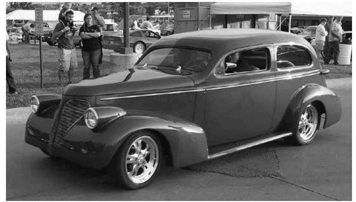
New La Vista Daze events included Hot Wheels races at the Community Center and a very successful car show and cruise at La Vista Keno.